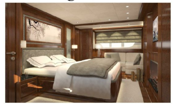
Master Cabin Guido de Groot design