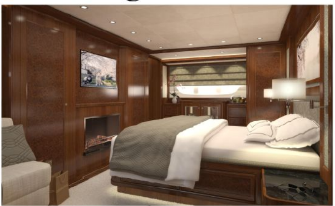
Master Cabin Guido de Groot design