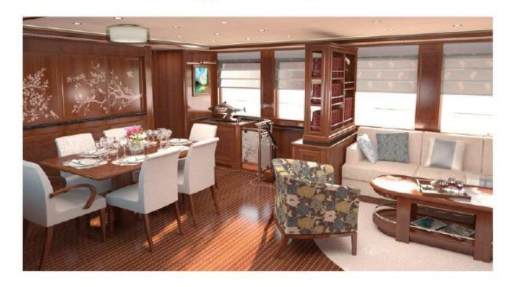
Main Salon Guido de Groot design