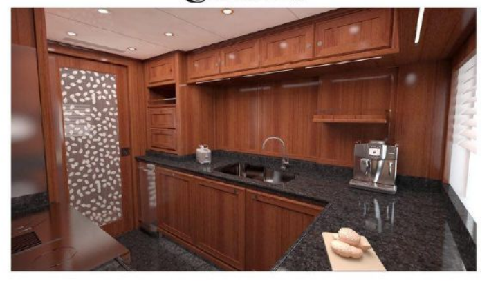
Galley Guido de Groot design