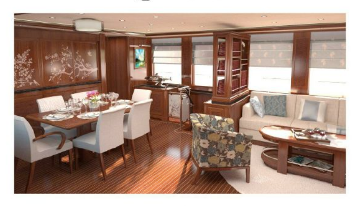
Main Salon Guido de Groot design