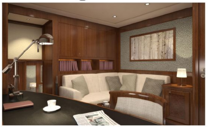
Master Cabin Guido de Groot design