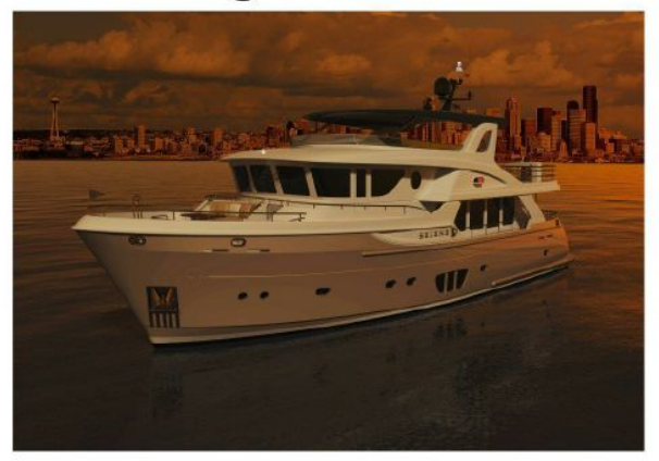
Guido de Groot- design