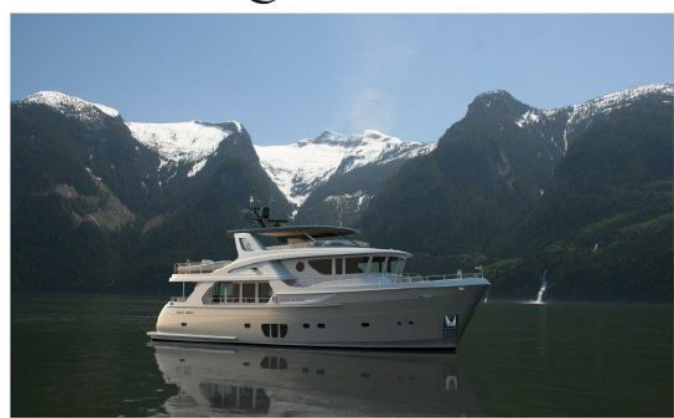
Guido de Groot design