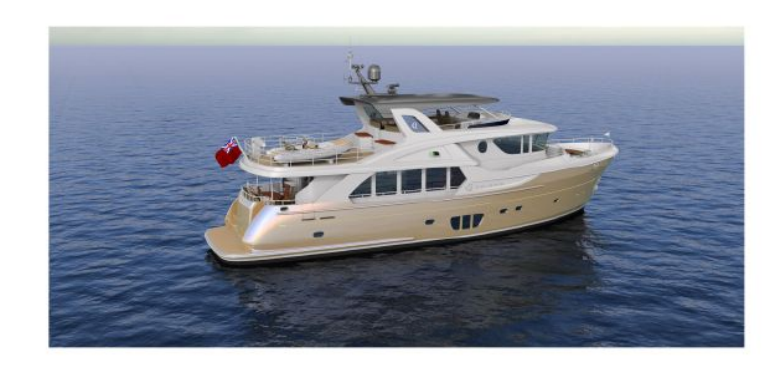
Guido de Groot design