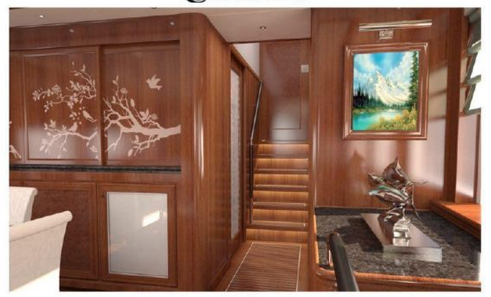
Main Salon Guido de Groot design