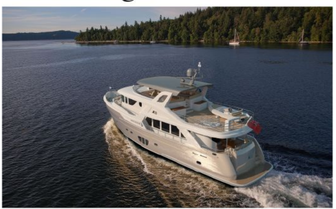
Cuido de Groot design