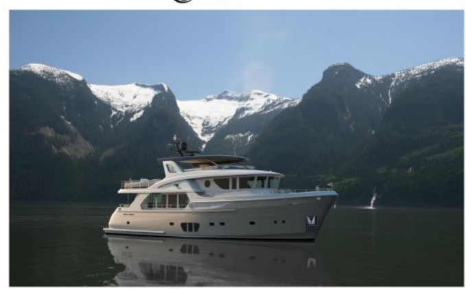
Cuido de Groot design