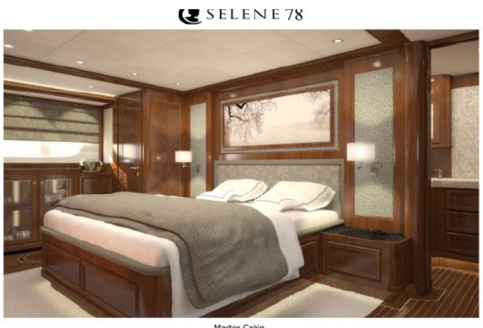
Master Cabin Guido de Groot design