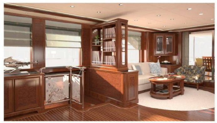
Main Salon Guido de Groot design