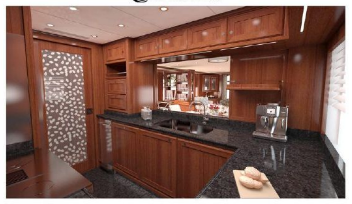
Galley Guido de Groot design