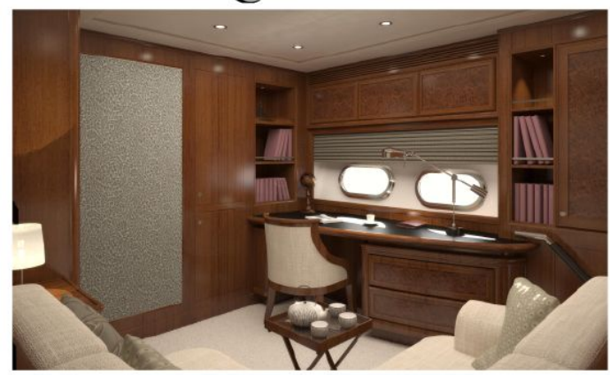
Master Cabin Guido de Groot desig