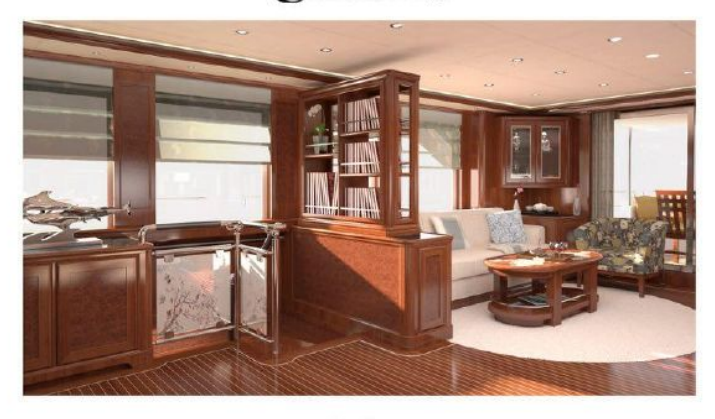
Main Salon Guido de Groot design