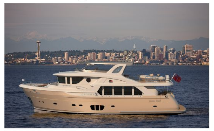
Guido de Groot design