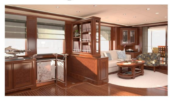
Main Salon Guido de Groot design