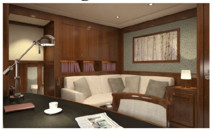
Master Cabin Guido de Groot design