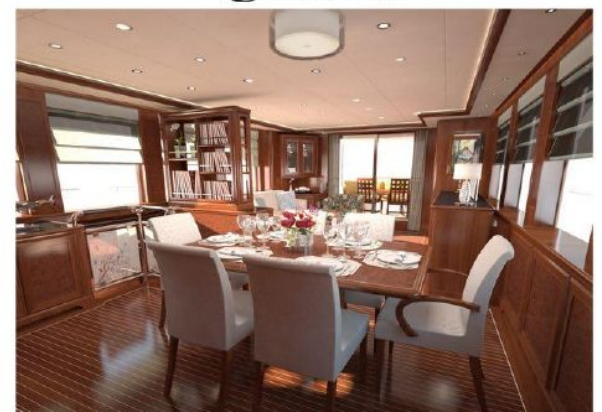
Main Salon Guido de Groot design