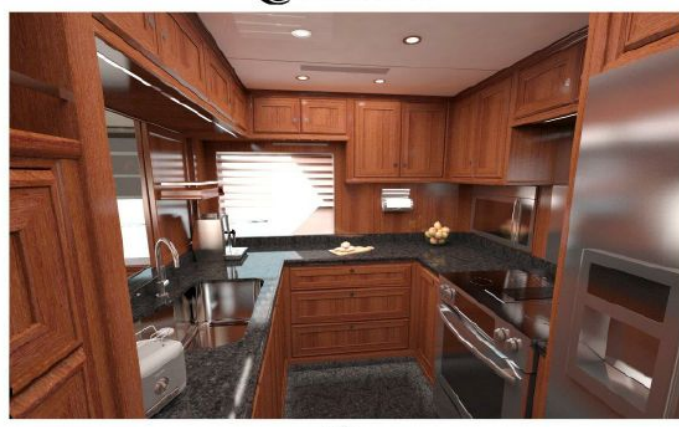
Galley Guido de Groot design