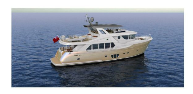
Guido de Groot-design