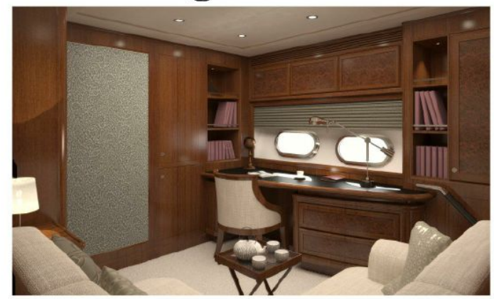
Master Cabin Guido de Groot design