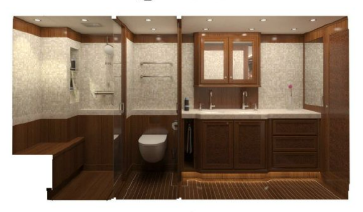
Master Cabin Guido de Groot design