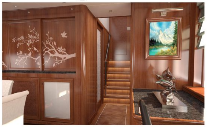
Main Salon Guido de Groot design