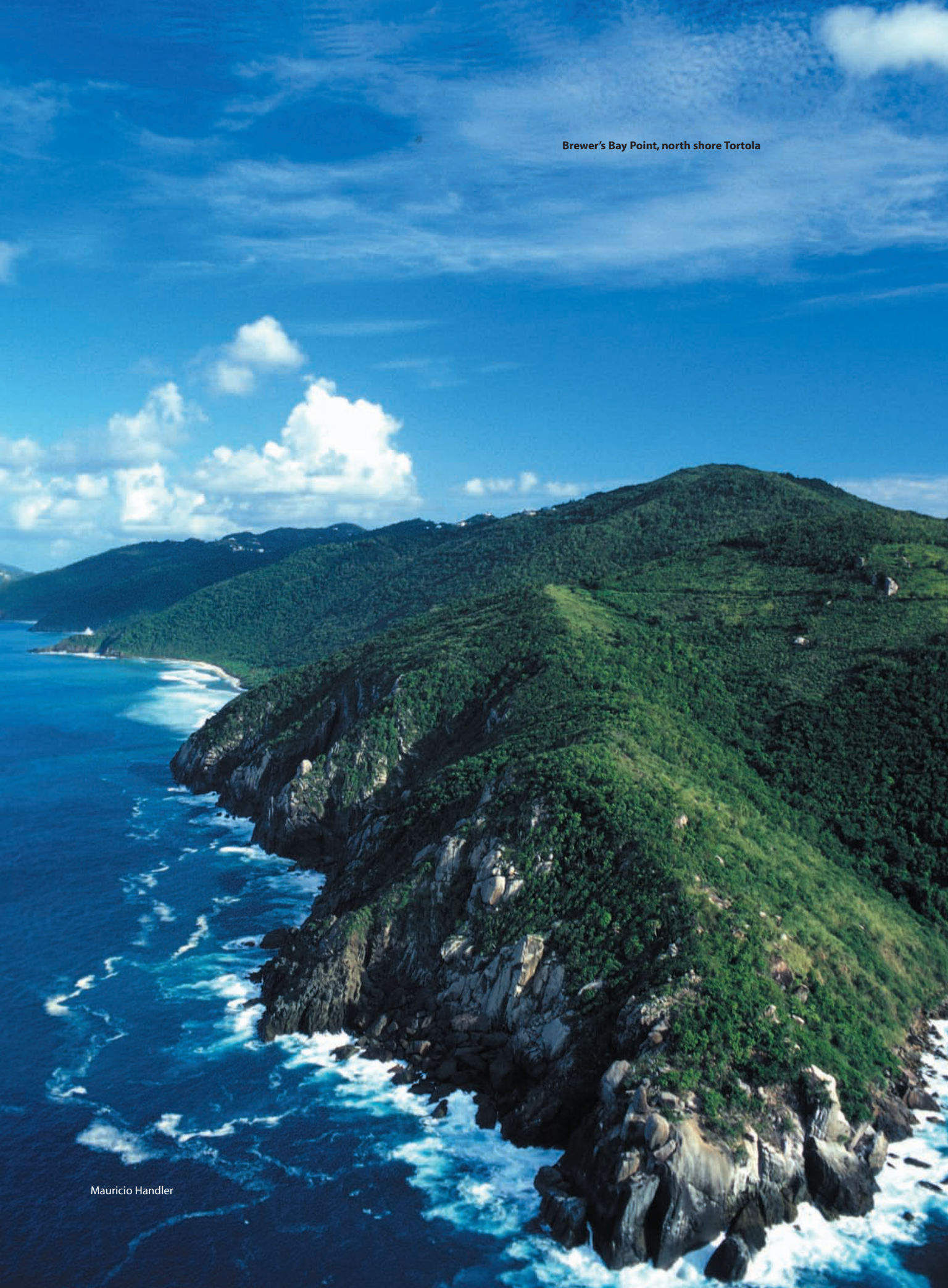
Brewer's Bay Point, north shore Tortola