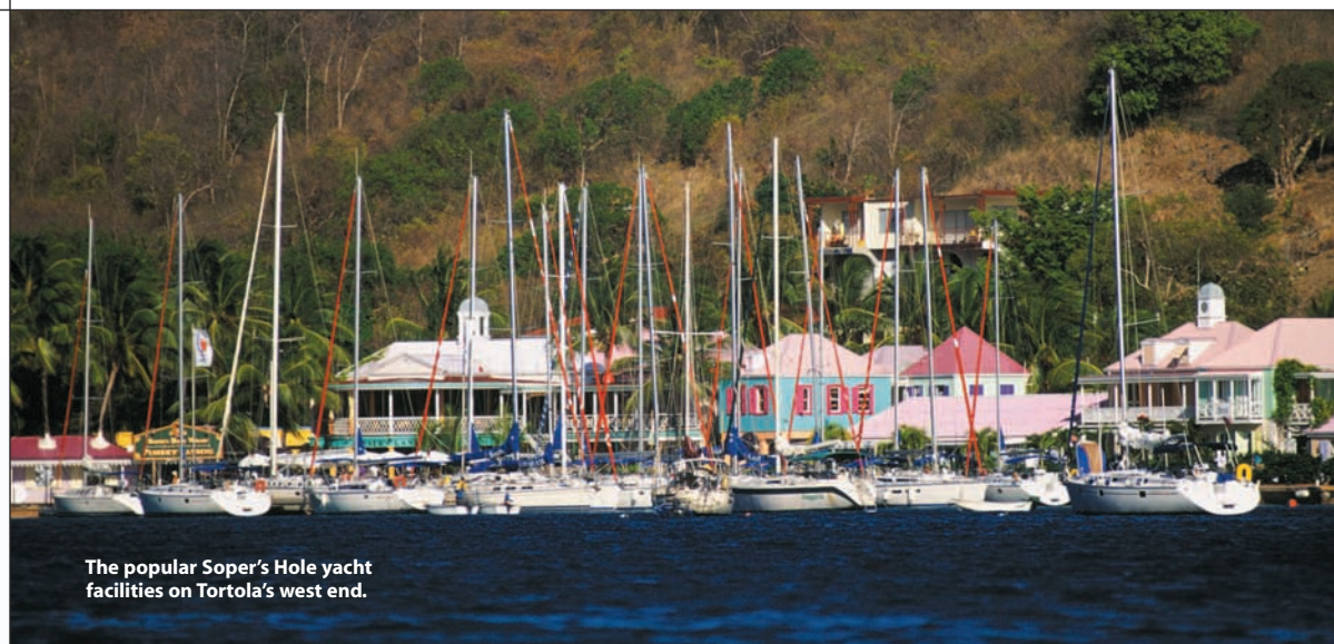
The popular Soper's Hole yacht facilities on Tortola's west end.