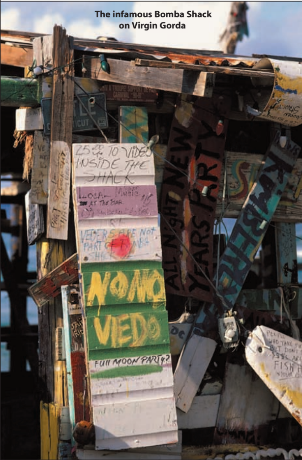
The infamous Bomba Shack on Virgin Gorda