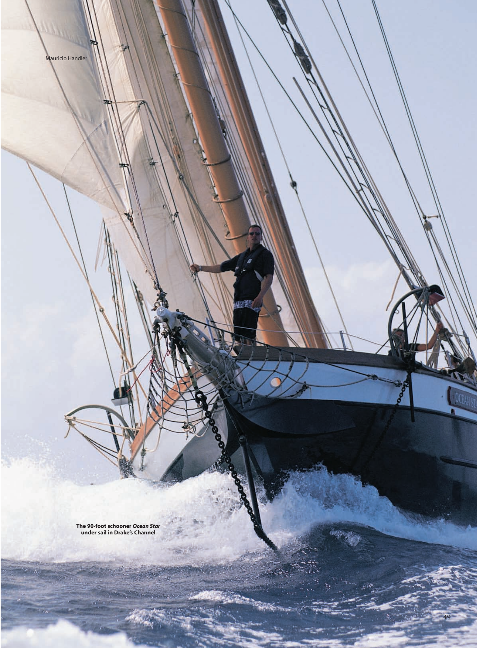
The 90-foot schooner Ocean Star under sail in Drake's Channel