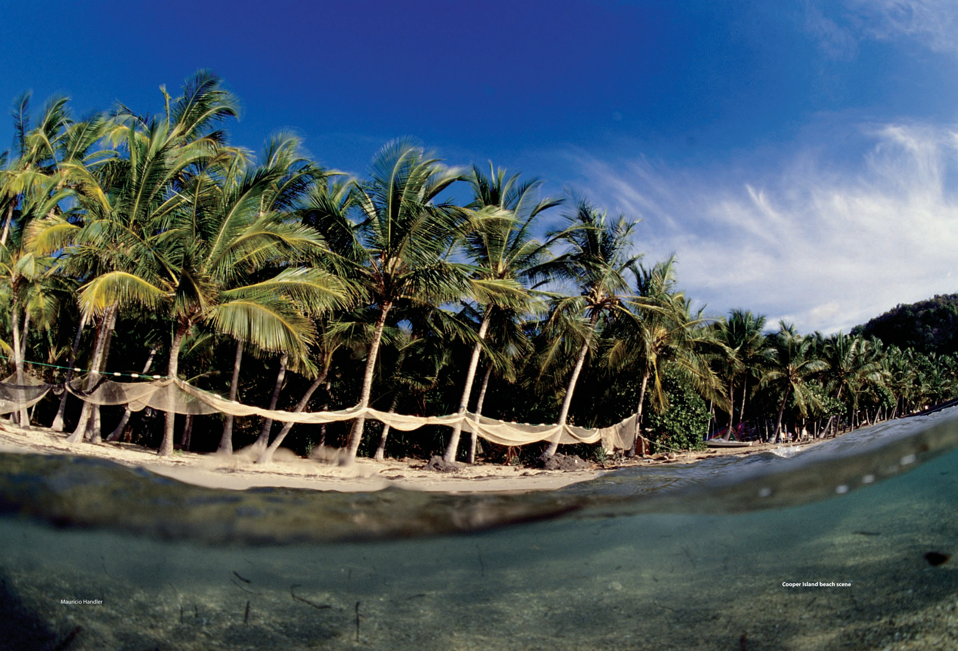
Cooper Island beach scene