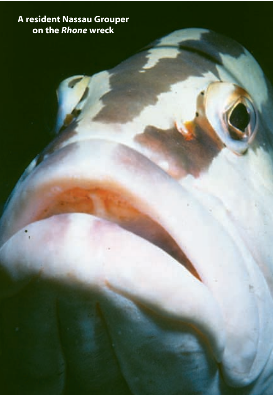
A resident Nassau Grouper on the Rhone wreck

When Hollywood went shopping for a real wreck to be the star of The Deep in 1976, the producers