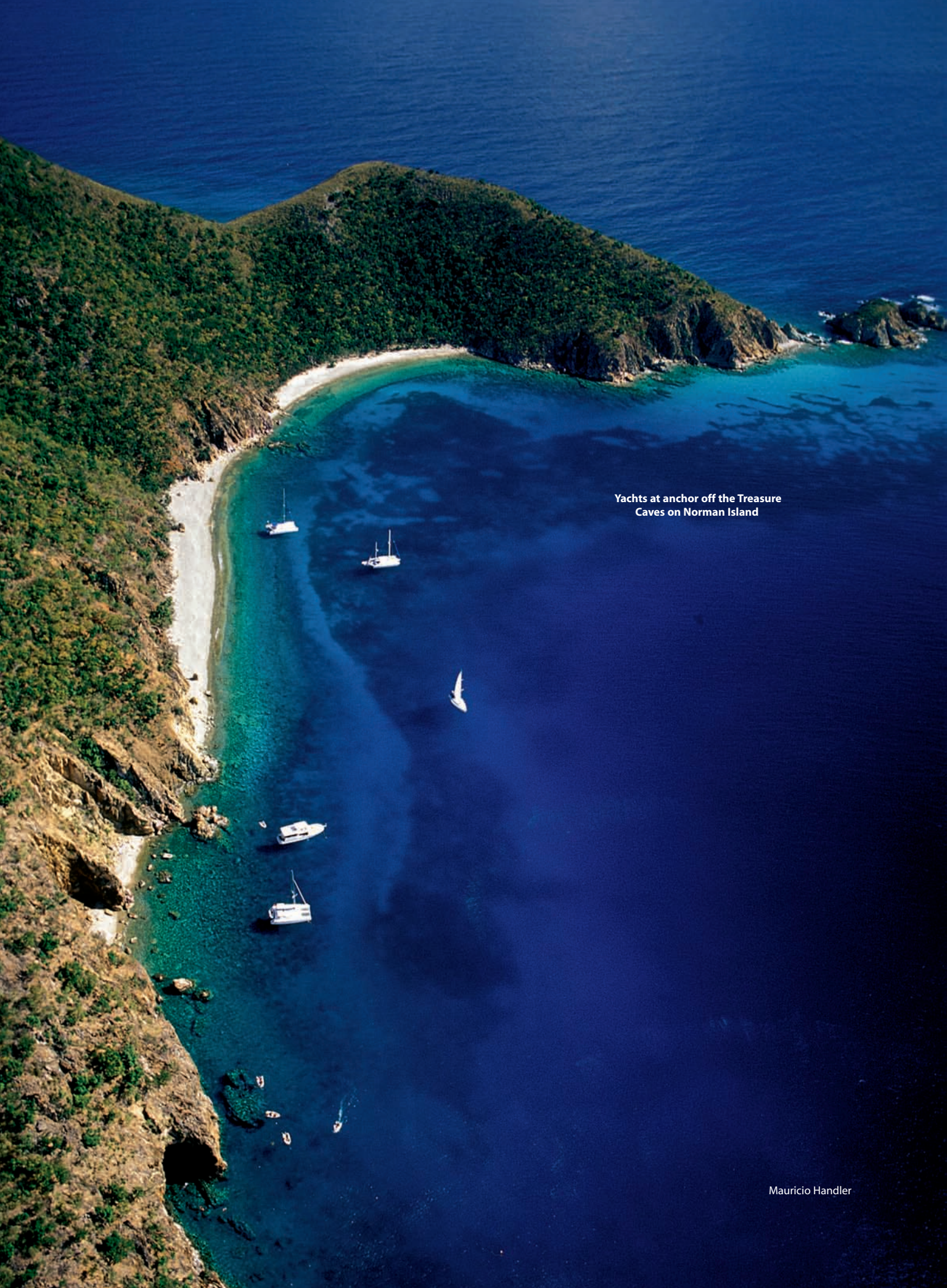
Yachts at anchor off the Treasure Caves on Norman Island