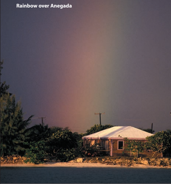
Rainbow over Anegada

Completing my nostalgic tour, I had the chance to stay again at my old favorite, Marina Cay, now operated by the Pusser's Rum group. This delightful island has benefited from enhanced landscaping, a large open-air dining room located right at beachside, an on-site Dive BVI facility, and newly constructed hotel suites with the same great views... only now with king beds, refrigerators, and (gasp!) hot water in the spacious bathrooms.