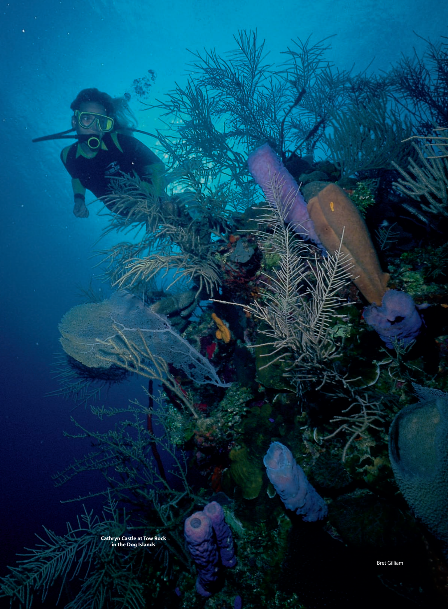
Cathryn Castle at Tow Rock in the Dog Islands