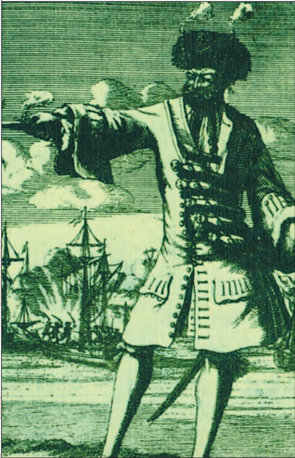
Captain Edward Teach, better known as Blackbeard, roamed the BVI in times past

marine life and radiant water. There was an unequalled serenity to this island chain of mostly uninhabited islets, cays, and spectacular beaches that was at once breathtaking and tranquil. Sort of a mixed high that left you exhausted from the singular pleasure of doing nothing but soaking in