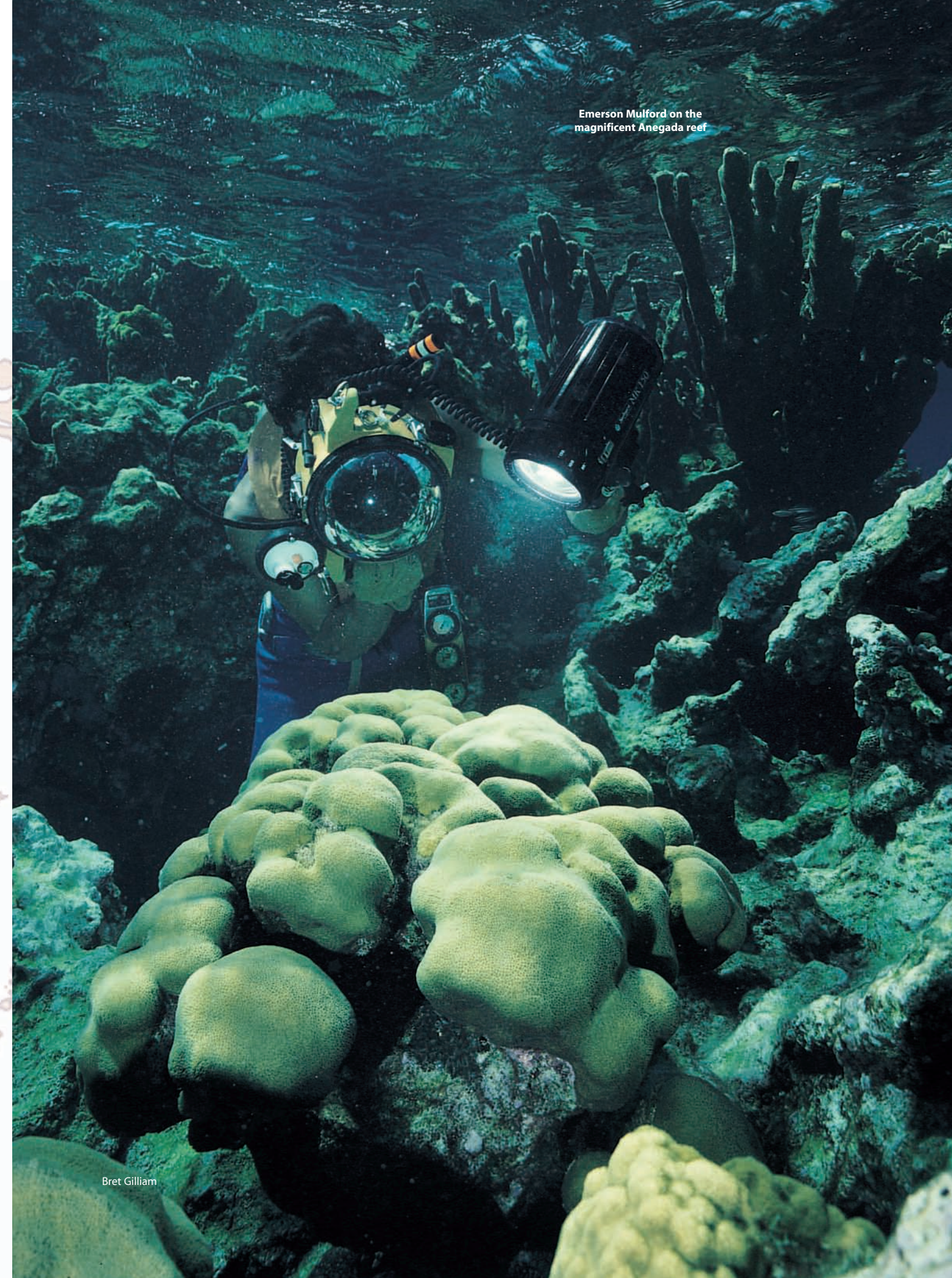
Emerson Mulford on the magnificent Aneгада reef