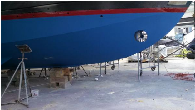
Vripack 54 Haulout 2