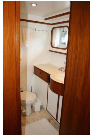
Vripack 54 Master Head