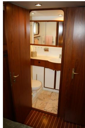
Vripack 54 Port Guest Head