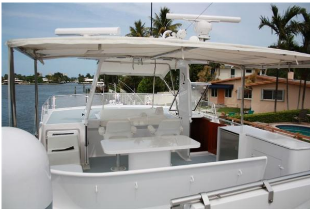
Vripack 54 Flybridge 2