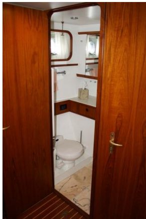
Vripack 54 Port Guest Head