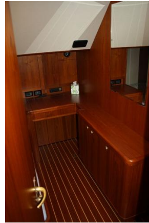
Vripack 54 Starboard Guest Stateroom 2