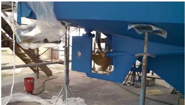
Vripack 54 Skeg