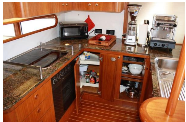
Vripack 54 Galley 4