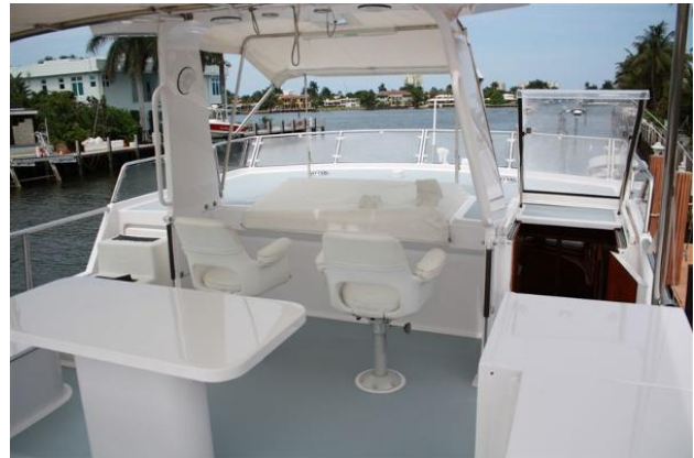
Vripack 54 Flybridge