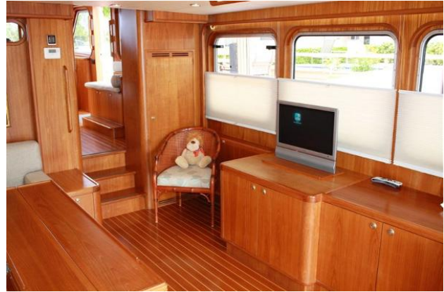
Vripack 54 Main Salon 6