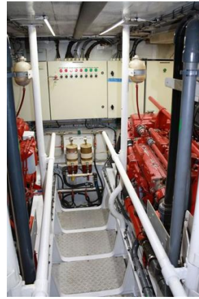
Vripack 54 Engine Room Forward 2