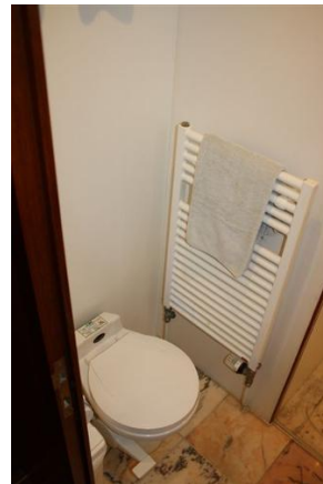
Vripack 54 Starboard Guest Head 2