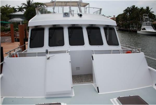
Vripack 54 Portugese Bridge and Pilothouse