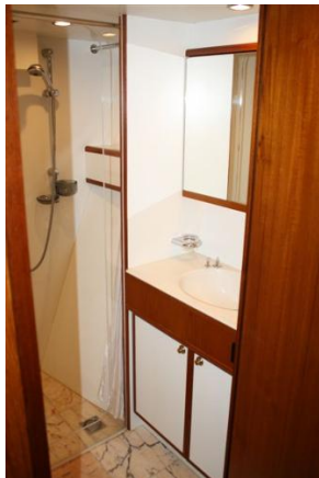
Vripack 54 Starboard Guest Head