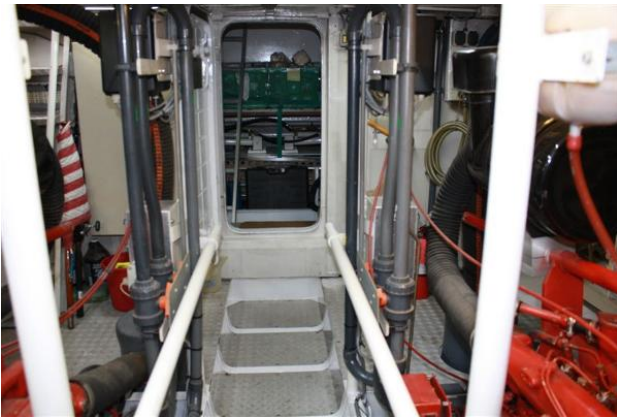
Vripack 54 Engine Room Aft-Door to Lazarette