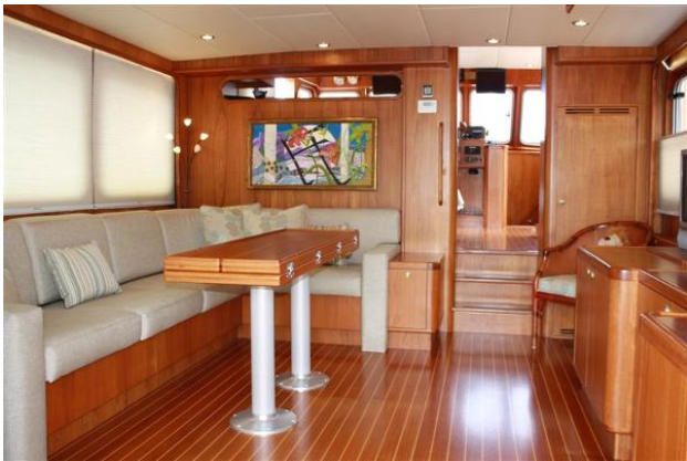
Vripack 54 Main Salon