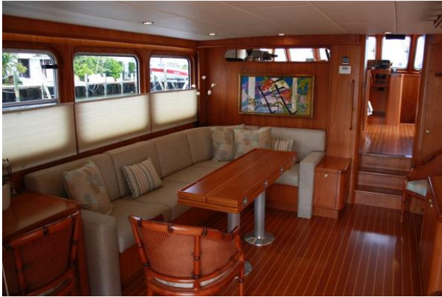
Vripack 54 Main Salon 3