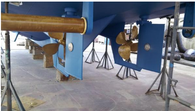
Vripack 54 Haulout Running gear