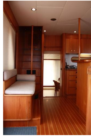
Vripack 54 Stairway to Flybridge