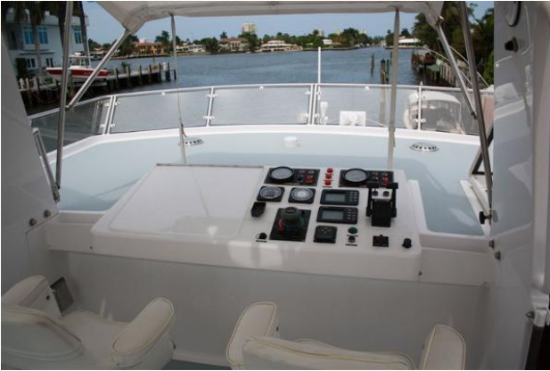
Vripack 54 Flybridge Helm