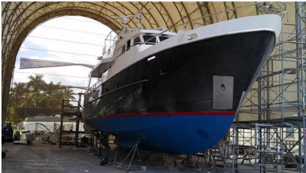
Vripack 54 Haulout