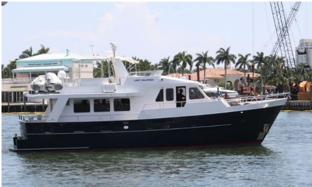
Vripack 54 Lady Galathea