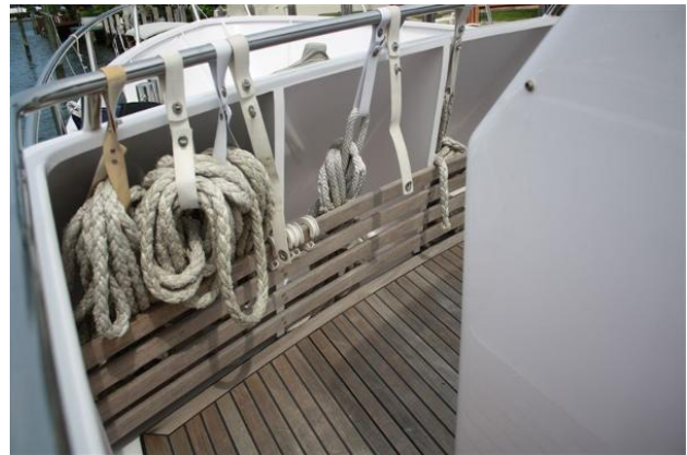
Vripack 54 Portugese Bridge Storage