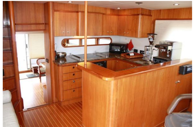
Vripack 54 Galley 2