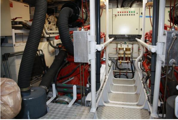
Vripack 54 Engine Room Forward