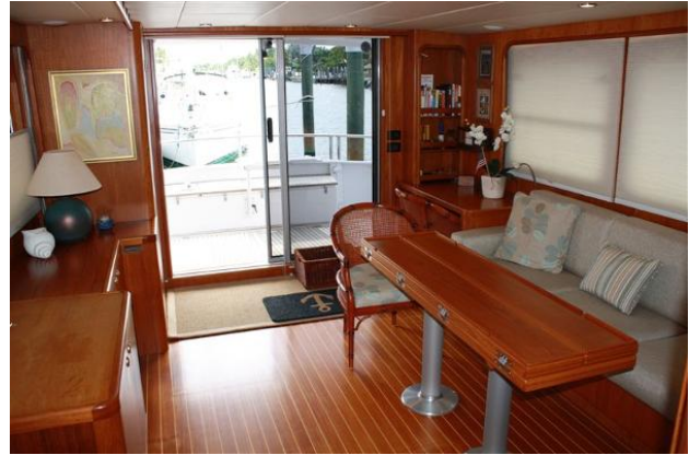
Vripack 54 Main Salon 4