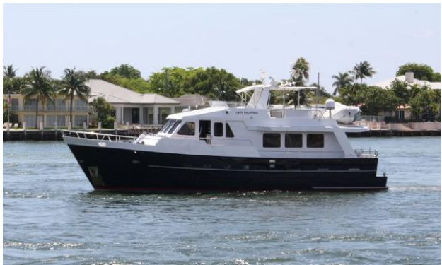
Vripack 54 Port Profile