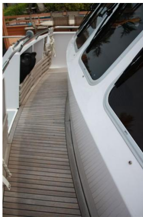
Vripack 54 Portugese Bridge