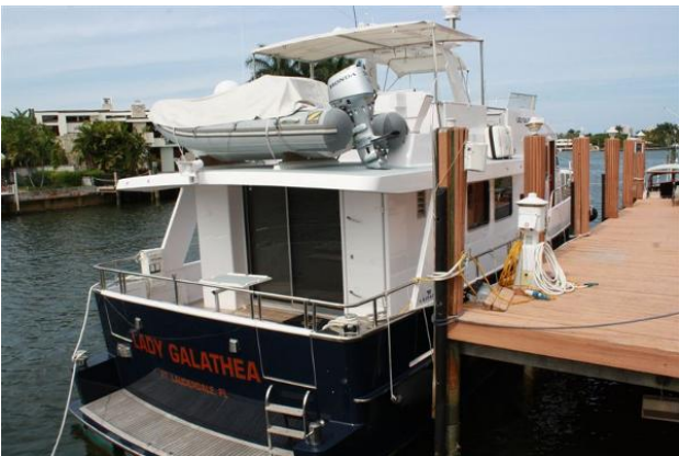
Vripack 54 Stern View