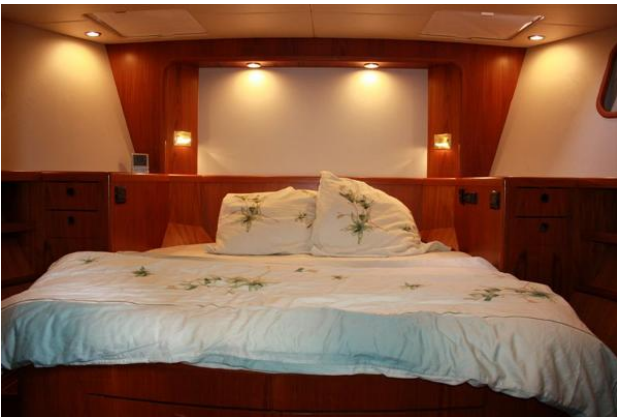
Vripack 54 Master Stateroom