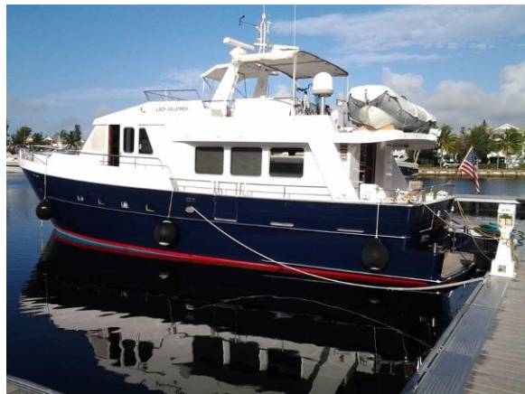
Port Profile 3