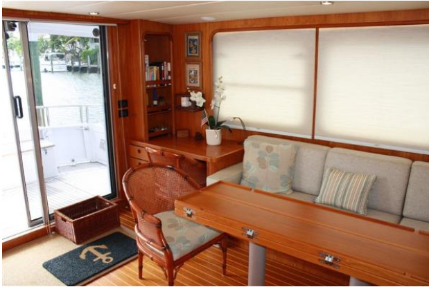
Vripack 54 Main Salon 5