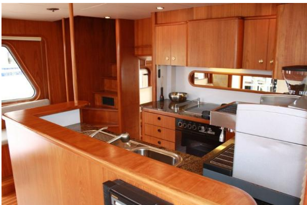
Vripack 54 Galley 3