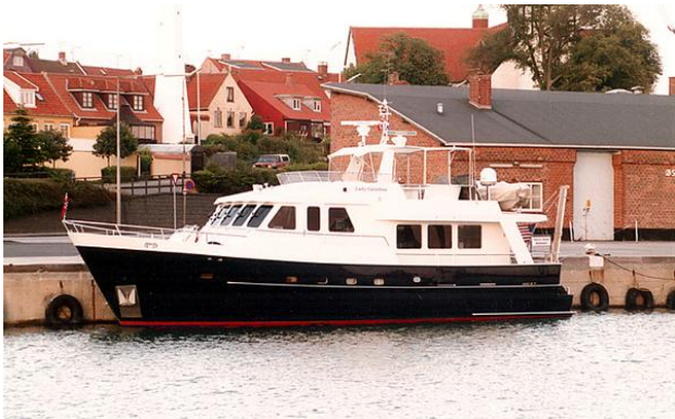
Vripack 54 Lady Galathea