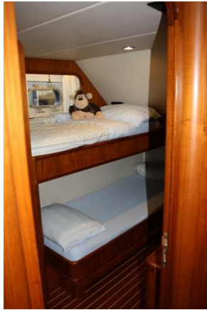
Vripack 54 Starboard Guest Stateroom