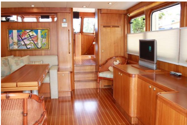
Vripack 54 Main Salon 7