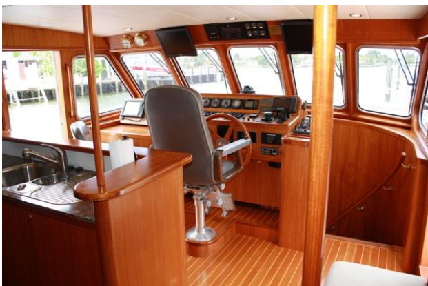
Vripack 54 Pilothouse