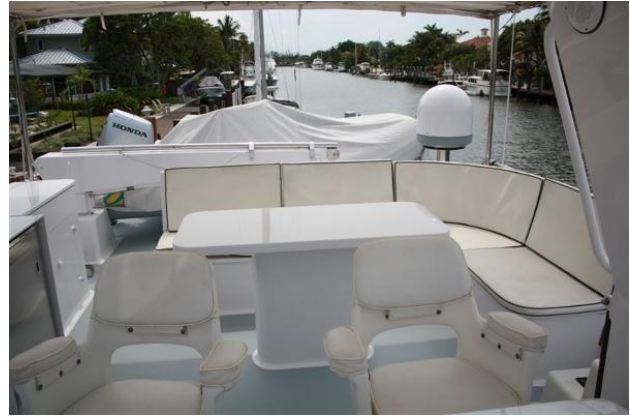
Vripack 54 Flybridge Settee