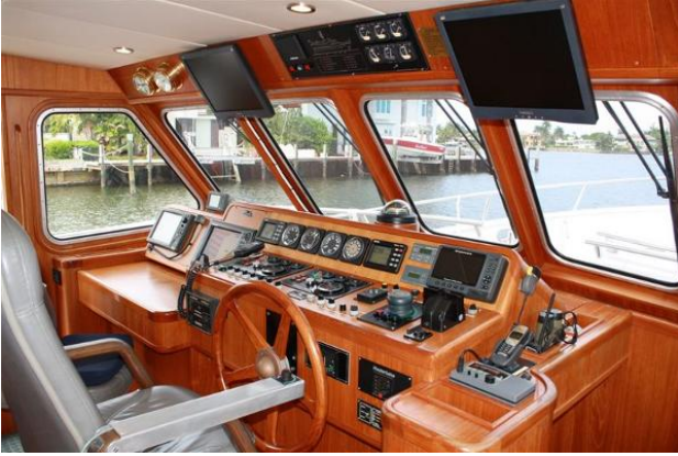
Vripack 54 Pilothouse 3