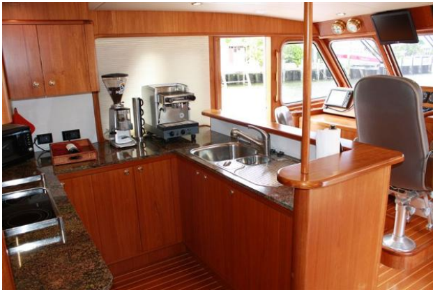
Vripack 54 Galley