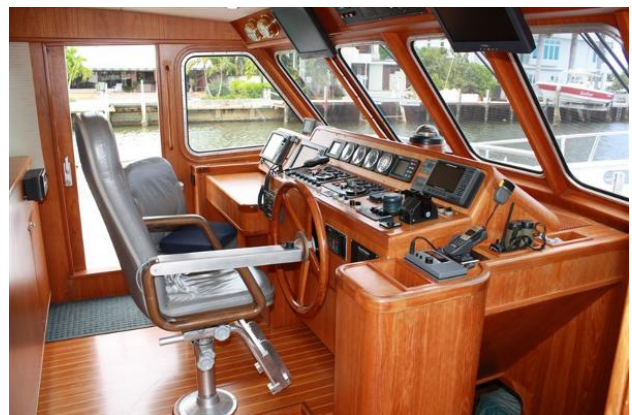
Vripack 54 Pilothouse 2