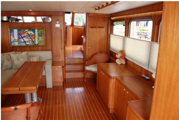
Vripack 54 Main Salon 2