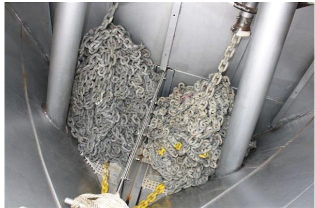
Vripack 54 Chain Locker