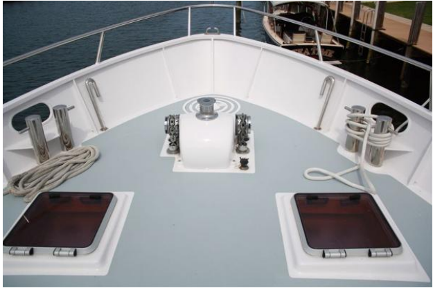
Vripack 54 Foredeck