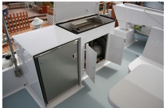
Vripack 54 Flybridge Bar B Que+Refrigerator