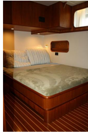
Vripack 54 Port Guest Stateroom