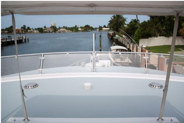
Vripack 54 View From the Flybridge Helm