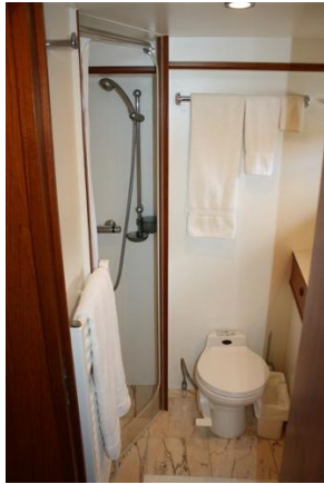
Vripack 54 Master Head 2