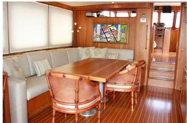
Vripack 54 Main Salon dining table